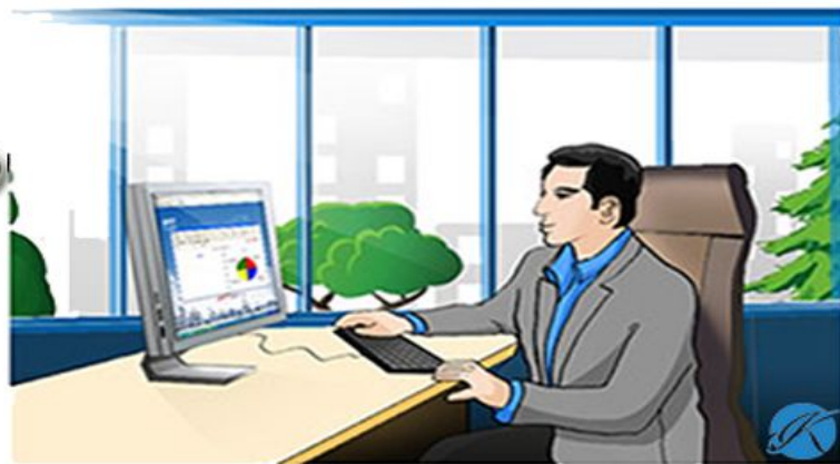
Check the Reports